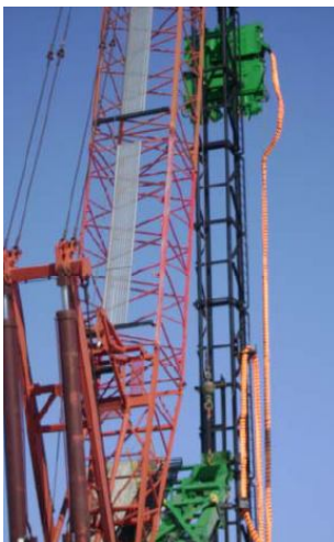
Group and protect hoses on pile driver against stretching and tearing.