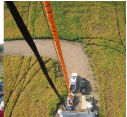
Group and protect hoses against stretching and tearing when servicing wind turbine. Fittings don't need to support the weight of hoses and will not pull out.